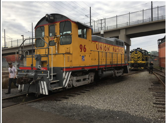
A few images from the Oregon Heritage Railway Museum.

A "must visit" museum if you are ever in Portland.