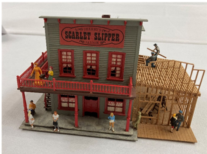
2nd Place—The Scarlett Slipper