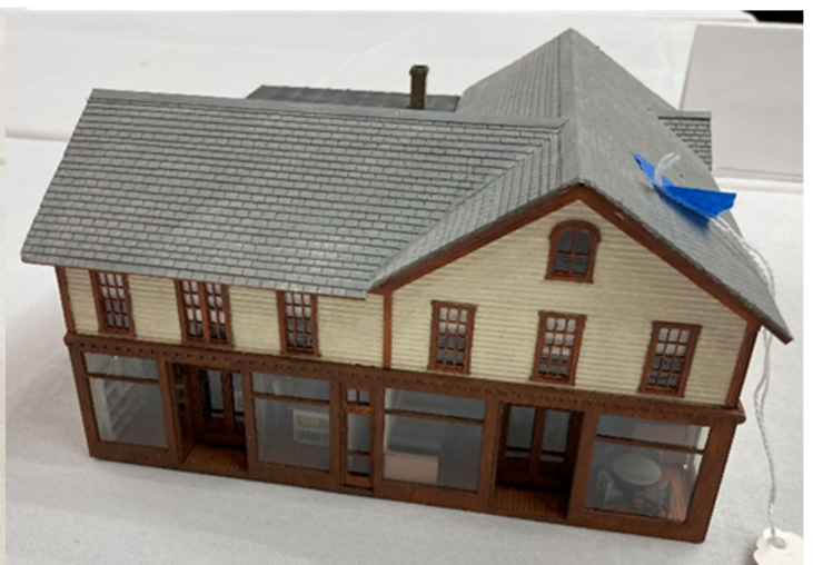
3rd Place—Dubois Store