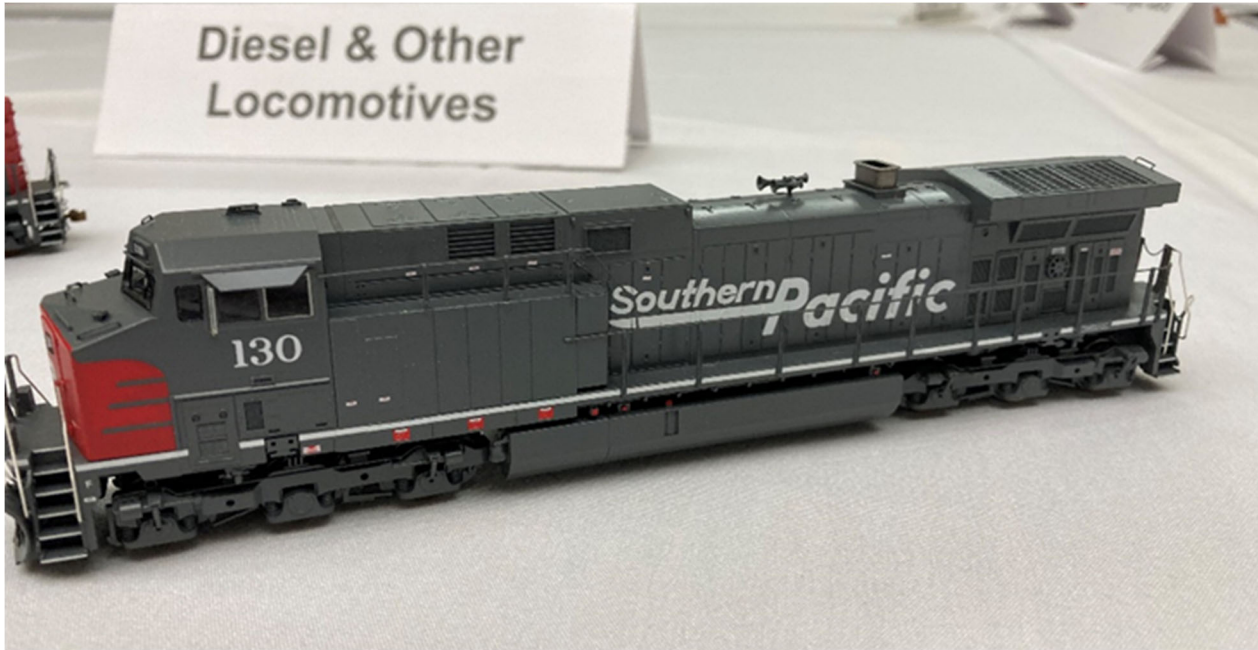
1st Place—Southern Pacific AC4400 #130