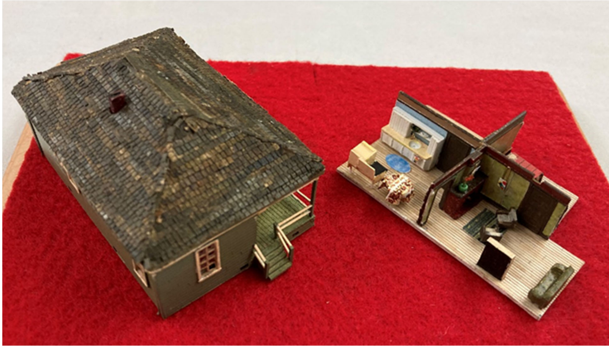
1st Place, Merit—Spreckels Sugar Company House