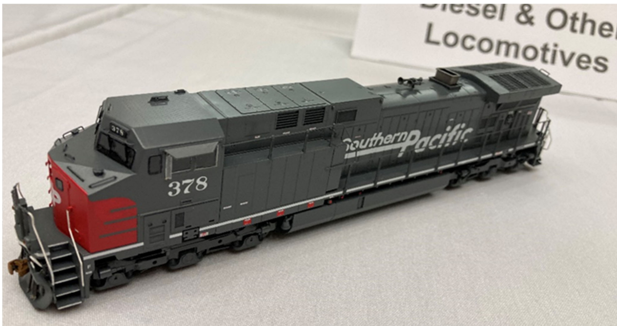
2nd Place—Southern Pacific AC4400 #378