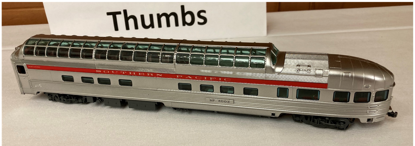
1st Place—Southern Pacific 3/4 Dome Observation Car