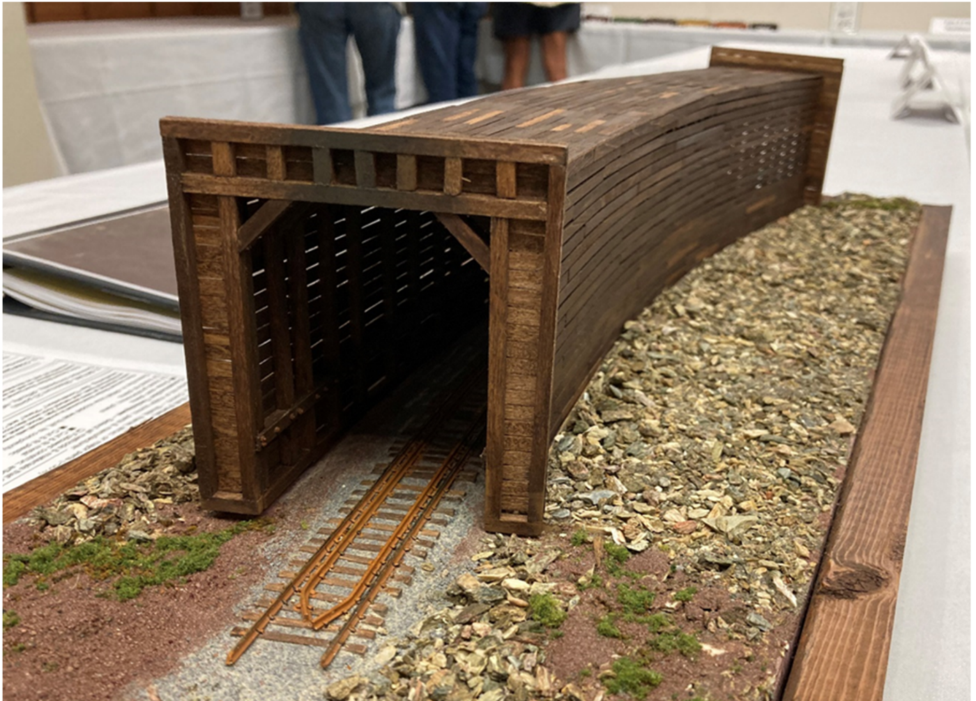
Timber Lined Tunnel